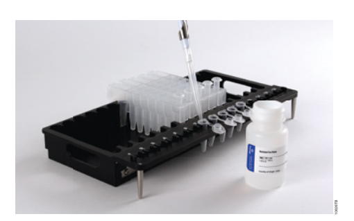
Figure 2. Setup and configuration of the deck tray. Elution Buffer is added to the elution tubes as shown. Plungers are in well #8 of the cartridge.